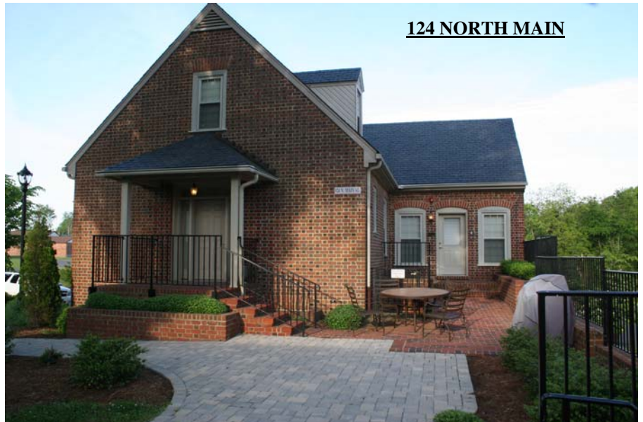
124 NORTH MAIN