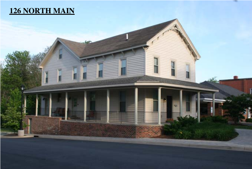
126 NORTH MAIN

LOCATED IN THE HISTORIC TOWN OF BOWLING GREEN, VIRGINIA