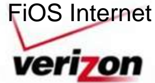
Internet Service 49.99 Per Month (basic package)