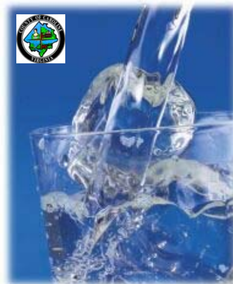
Caroline County Water Cost Per Gallon $0.00125 (Tier 1)