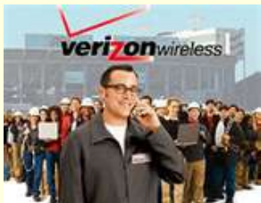
Cell Phone Service 39.99 Per Month (basic package)