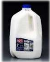
Milk $4.29 per gal.